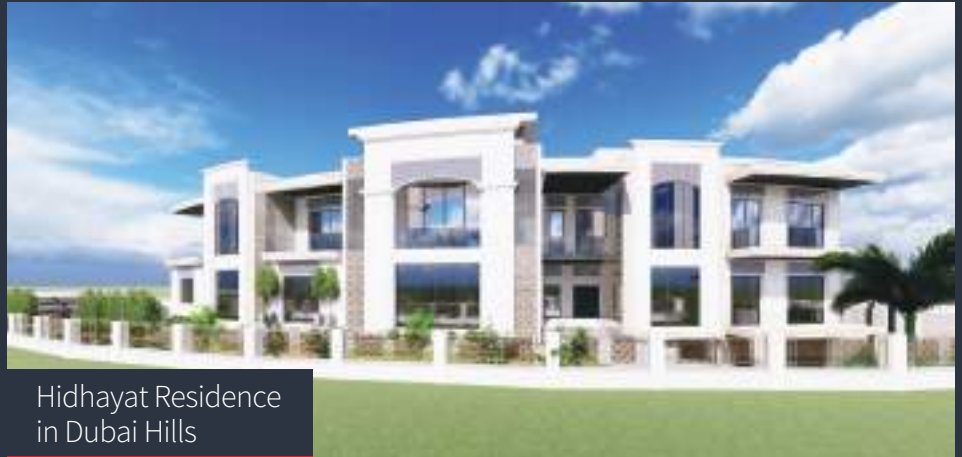
Hidhayat Residence in Dubai Hills