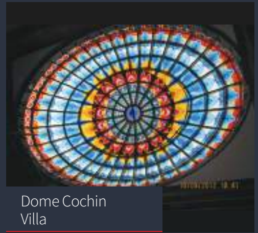
Dome Cochin Villa