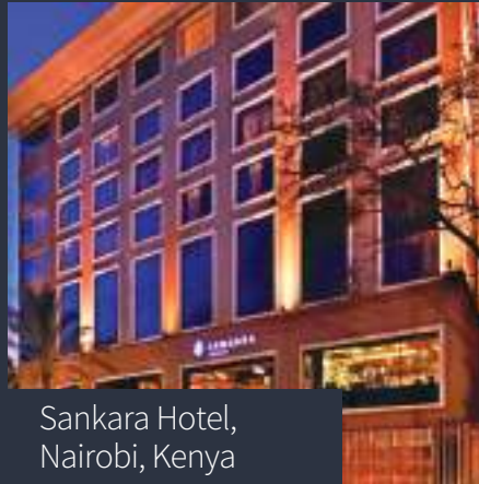
Sankara Hotel, Nairobi, Kenya