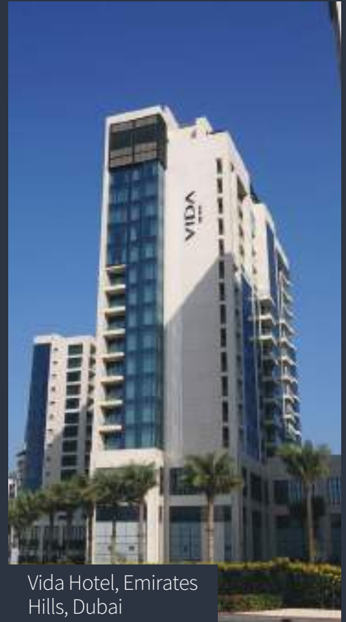
Vida Hotel, Emirates Hills, Dubai