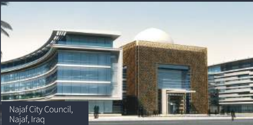
Najaf City Council, Najaf, Iraq