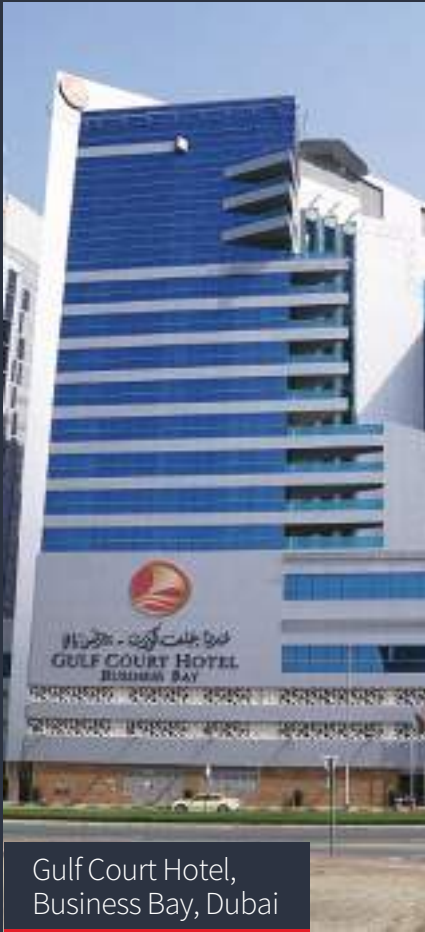
Gulf Court Hotel, Business Bay, Dubai