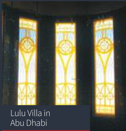
Lulu Villa in Abu Dhabi